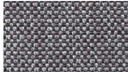
FAB-TLT-13 DARK CHOCOLATE