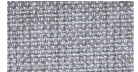
FAB-TLT-25 DIM GREY