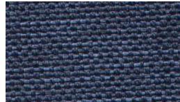
FAB-TLT-21 DARK BLUE