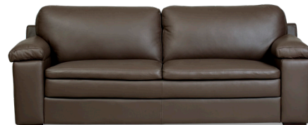
3 SEAT DUO